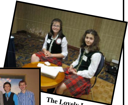
The Lovely Lassies!