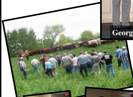
Fantasy Lane Farm Tours