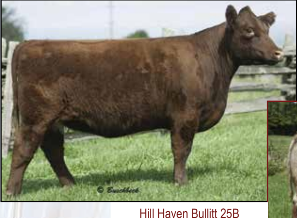
Service Sire to Lot 104 & 107

A daughter of Hill Haven Verena 30Y who sold in Hill Haven's 2015 Selection Sale. Vernisse has her dam's impressive spring of rib along with a moderate, stylish frame. She is bred to Hill Haven Bullitt 25B and we expect this genetic combination will be a great match. THF, PHAF, DSF by pedigree. Bred June 25th to Hill Haven Bullitt 25B X-[CAN]*21150