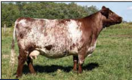
MSF 8Y - 50P daughter