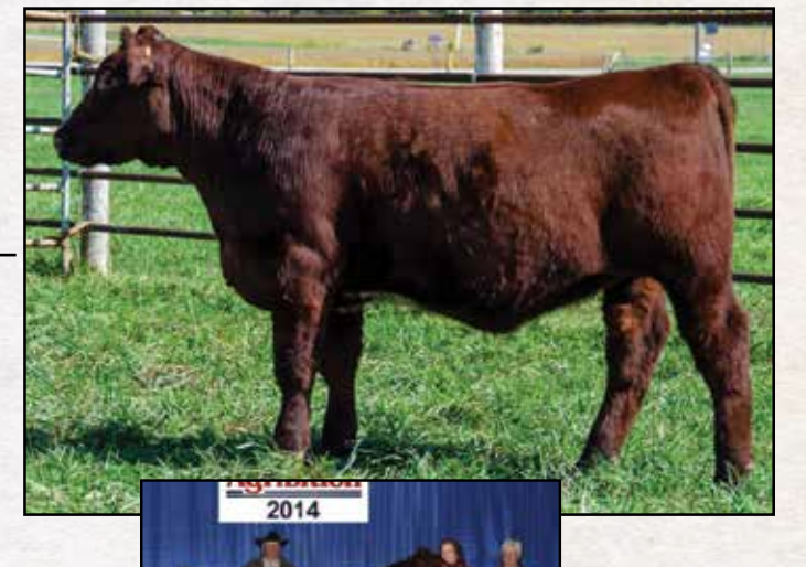
Lot 14 Dam

I have always been a believer in the importance of cow families, and the Julie's have always been a favourite of mine. When the opportunity to buy HC Julie 28A came up at the Horseshoe Creek Herd Reduction Sale Crawfdown and I jumped at it. Nice complete red heifer sired by the time tested Primo 40P bull. This one is as quiet as a kitten, juniors have a look!