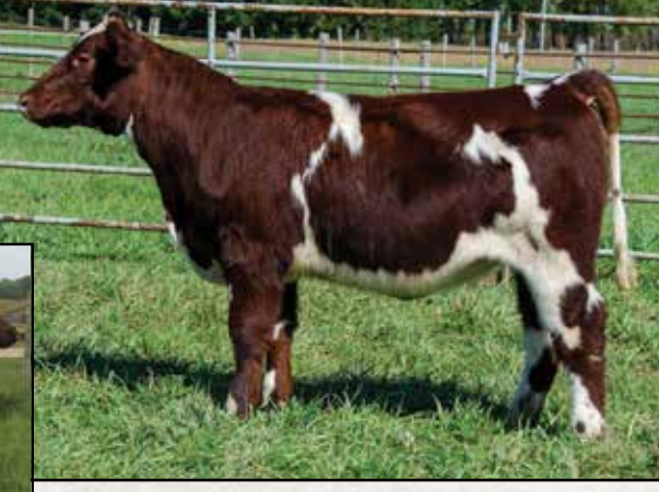
Lot 15 Dam